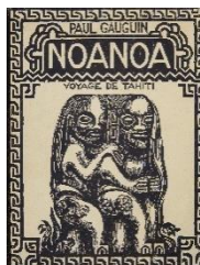
Kunstner/artist Paul Gauguin (1848-1903) Titel, år/title, year Noa Noa: voyage de Tahiti. Berlin, 1926