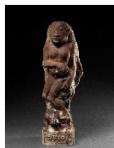
Kunstner/artist Paul Gauguin (1848-1903) Titel, år/title, year Oviri. 1894

Teknik/media Figur, delvist glaseret stentøj/figure, partly glazed stoneware