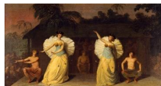
Kunstner/artist Nicolai Abraham Abildgaard (1743-1809) Titel, år/title, year Dansescene fra Tahiti / Dance scene from Tahiti, 1794-1798