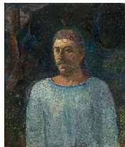
Kunstner/artist Paul Gauguin (1848-1903) Titel, år/title, year Selvportræt (Nær Golgatha). Self-Portrait (Near Golgotha), 1896

Teknik/media Olie på lærred / Oil on canvas